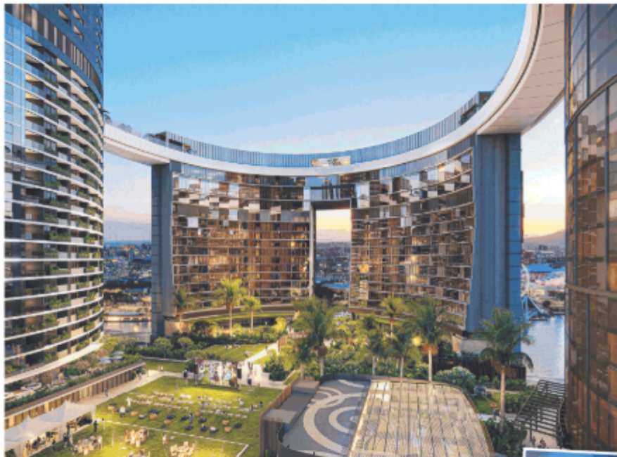
Work on the $3.6 billion Queen's Wharf project is about to go into overdrive with the workforce growing to 2000.